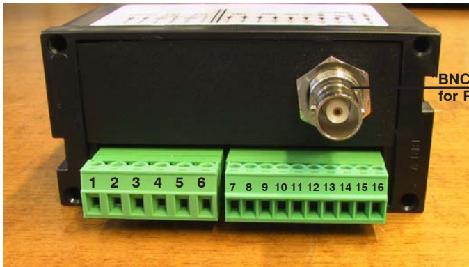
"BNC" connector for Redox probe