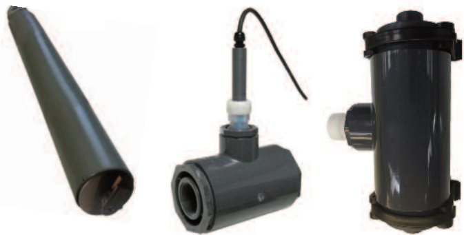
Sensor with cleaning wiper Flow Through Assembly Debubbler Assembly

The Triton TR80 uses a nephelometric 90° NIR scattered light optical method for determining turbidity or suspended solids. A light beam is directed into the sample where it is scattered by suspended particles in the water. The amount of scattering depends on the amount of material in the water, the wavelength of light used and the size and composition of the suspended particles. Designed for use in environmental, water treatment, or drinking water, the Triton TR80 is suitable for most aqueous applications. It is not suitable for use in organic solvents or in solutions with an extreme pH value, only use when the pH is between 2-12 pH. The temperature range for the sensor is 0° to 50°C. Turbidity, the cloudiness or haziness of a water sample, is caused by particles suspended in the water, typically clay and silt. Since bacteria and viruses can be attached to these particles, turbidity has become a critical indicator of the overall water quality.