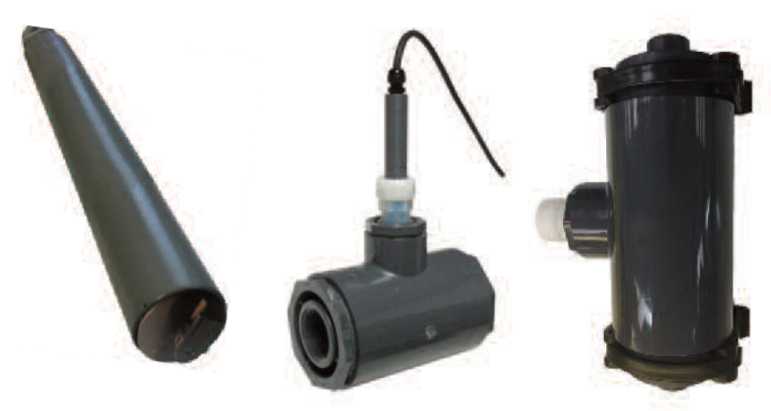
Sensor with cleaning wiper Flow Through Assembly